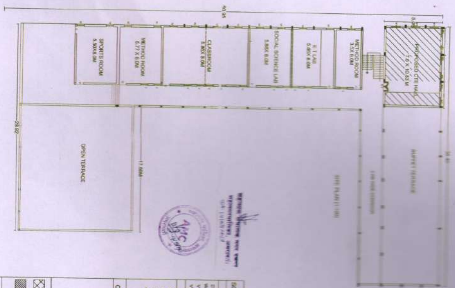
PROPOSED CONSTRUCTION AND EXISTING FIRST FLOOR

श्री शिवाजी कॉलेज ऑफ एजुकेशन शिवजी नगर, अमरावती